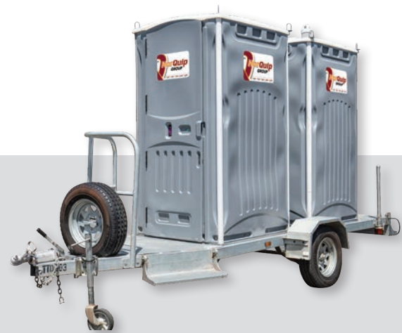
Trailer Mounted Showers