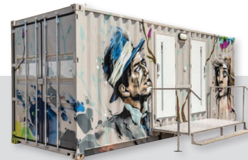
VIP Ablution Block