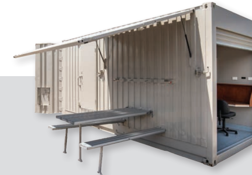
Containerised Site Solution