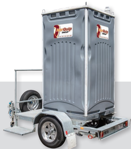
Trailer Mounted Toilets