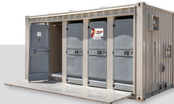
8 Head Shower Block